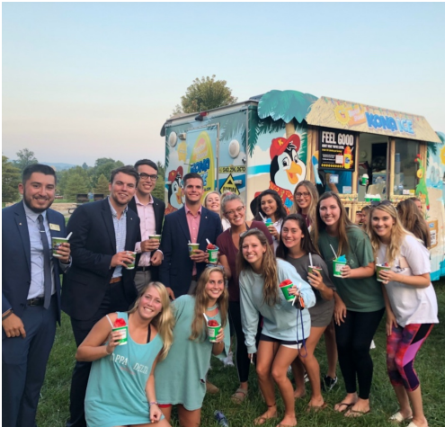
According to the Expansion Team these Virginia Tech Kappa Delta's tried to become Founding Fathers at Delta Chi!