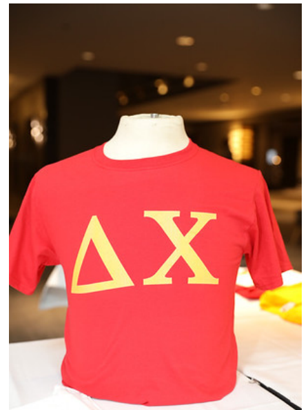
Unfortunately there were no size XX's to be found at the Convention!