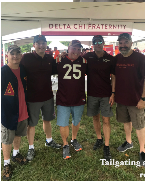
Tailgating at the Virginia Tech-William and Mary Game, reputedly a "dry" recruitment event