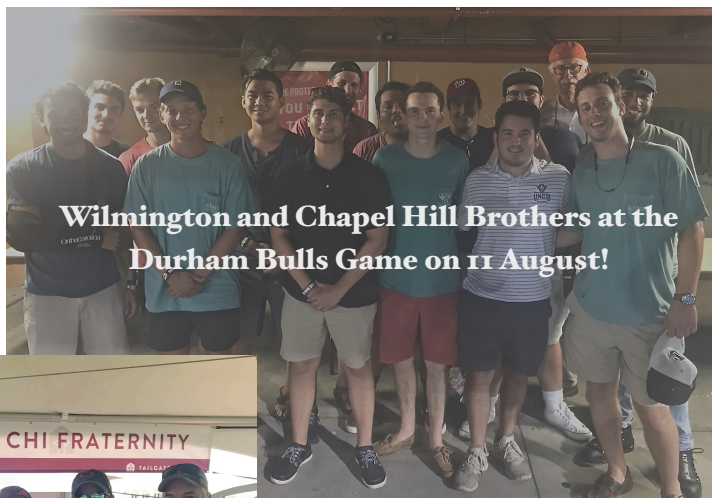
Wilmington and Chapel Hill Brothers at the Durham Bulls Game on 11 August!